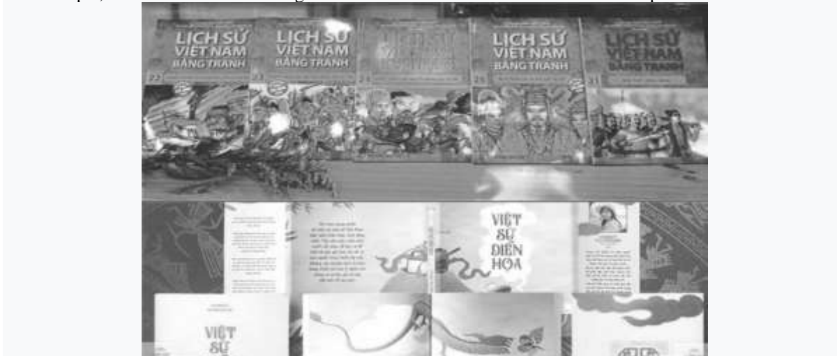
Fig.3: Reading historical stories with pictures

For example, teachers can include and guise their students t real historical stories with pictures: