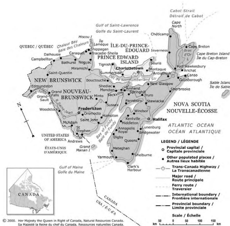
MAP OF THE MARITIME PROVINCES