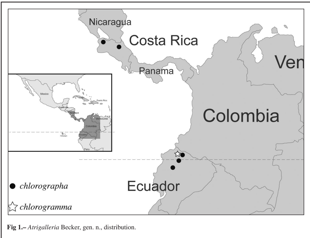
Fig 1.- Atrigalleria Becker, gen. n., distribution.

Distribution (fig. 1): Ecuador, Costa Rica, at mid to high elevations.