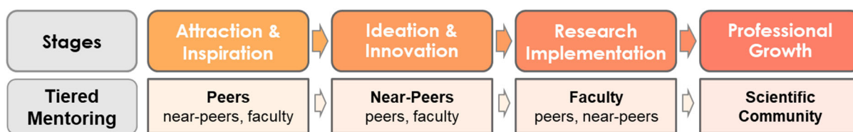
Figure 1. The four stages of the ASCEND Entrepreneurial Research Training Model and its alignment with the tiered mentoring program.