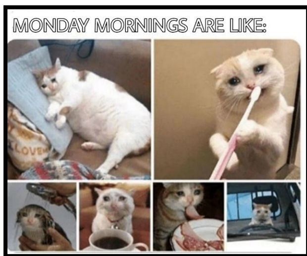
Pic. 1 – meme for task 1

It is also important to emphasize that due to the collective nature of the product, in the interpretation of Internet memes, su