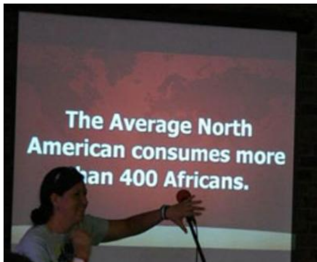
Pic. 5 – meme for task 3

3. Divide the students into two groups, the first one should prove that the text of the memes is correct, the second group should object it(Figure 5, Figure 6)