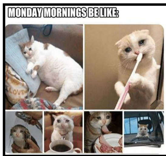
Pic. 2 - meme for task 1