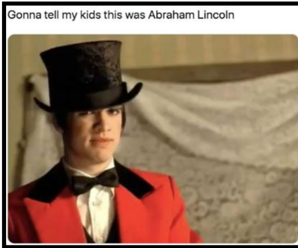
Pic. 3 – meme for task 2