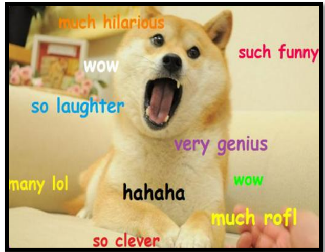
Pic. 4 - memktask2

Answer Figure 3: I'm gonna tell my kids this was Abraham Lincoln / I'm going to tell my kids this was Abraham Lincoln. An English sentence cannot exist without a subject and a verb.