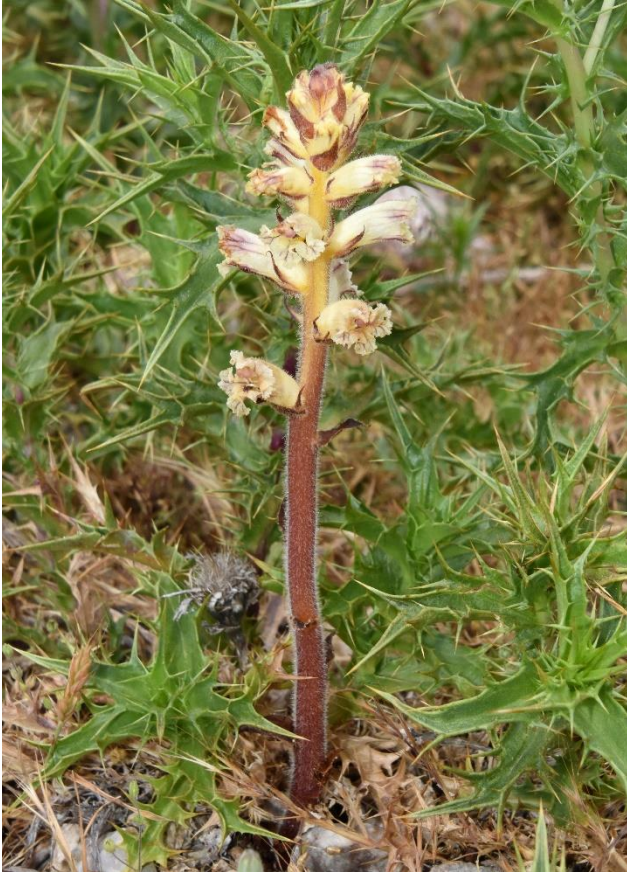
Figure 6. Field photo of Orobanche balsensis from Mallorca, Penyal des Migdia.

is more widely distributed than the available data suggests. In addition to the data here provided, in the website "Biodiversidad Virtual" [consultation: March 2013] there is an image of a Majorcan specimen of Orobanche from Esporles, which undoubtedly corresponds to O. balsensis .