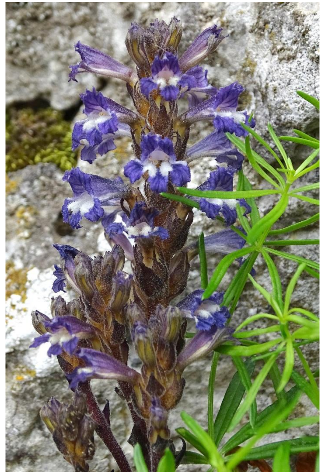
Figure 7. Field photo of Phelipanche olbiensis from Mallorca, Sa Rateta.

Balearic endemics Helichrysum crassifolium and Galium crespianum Willk. According to Pujadas & Mus (2010) P. olbiensis should be considered an endangered species in the Balearic Islands. The populations from southern Mallorca are perhaps under threat from habitat disturbance caused by human activities. By contrast, the populations from northern Eivissa and northern Mallorca are not exposed to significant threats. Considering the whole of the populations of the Balearic Islands, this species would not qualify for a risk category according to IUCN (2012) criteria. This parasitic species is probably more frequent in the Balearic Islands than available data suggest.