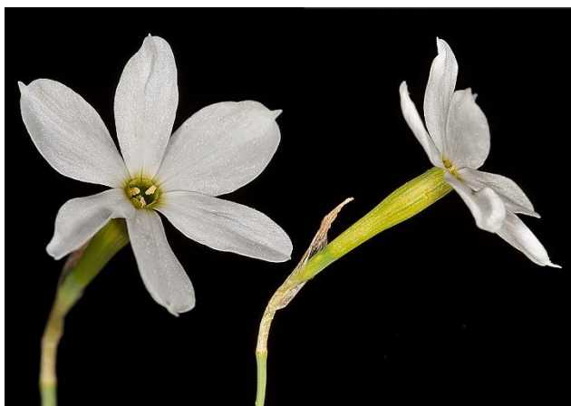
Figure 3. Field photo of Narcissus serotinus from Formentera.

The collection cited is the first unambiguous record for the Balearic Islands (Aedo, 2013).