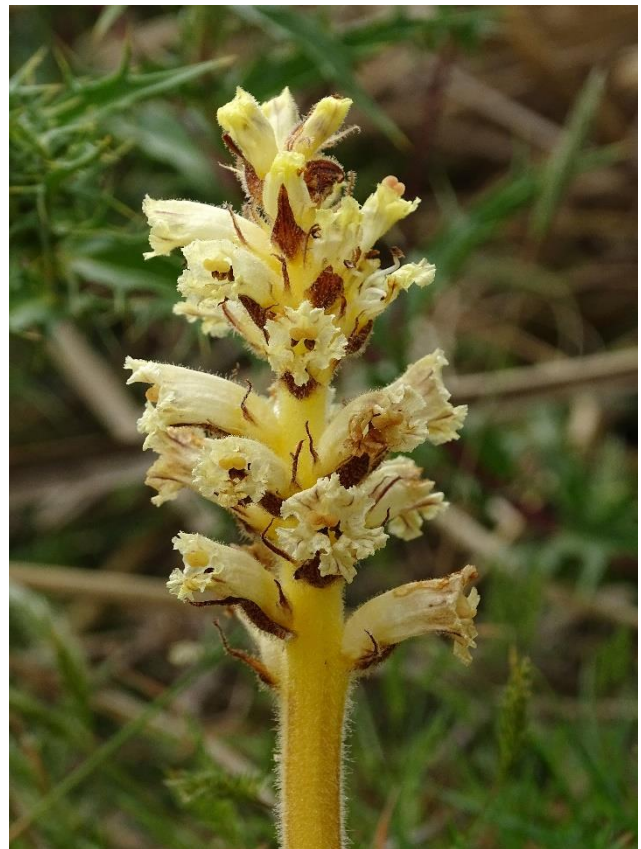
Figure 5. Field photo of Orobanche balsensis from Mallorca, Sa Rateta.

The verification that plants of the genus Carlina are parasitized by some Orobanchaceae in the Balearic Islands comes from ancient times. Rodríguez (1879) reported " Orobanche loricata Rchb.?" from Puig de Torrella, growing on the roots of Carlina [in all probability C. corymbosa ]. This record was repeated by Barceló (1879-1881), Knoche (1922, sub O. picridis ), Bonafè (1980, sub O. loricata ), Beckett (1993 sub O. loricata ) and Bolòs & Vigo (1996, sub O. artemisiae-campestris subsp. picridis ). Recently, Alomar et al. (1995) and Fraga-Arguimbau et al. (2016) reported for Menorca O. picridis and O. artemisiae-campestris , respectively, in both cases parasitizing Carlina corymbosa . According to Sánchez Pedraja et al. (2016+) O. artemisiae-campestris and O. picridis exclusively parasitize Artemisia campestris and Picris hieracioides , two species absent in the Balearic Islands. Habashi & Jeanmonod (2008) ruled out the presence in Corsica of both O. picridis and O. artemisiae-campestris . Pujadas (2001; 2010) provided a list of herbarium specimens belonging to Orobanche santolinae from the Balearic Islands. One of them (indicated above) was collected in Cabrera. Based on the arrangement of the corollas (patent to erect-patent) this specimen is referred to O. balsensis . In fact, there is no evidence of the presence on Cabrera of plants of the genus Santolina , which are the hosts of O. santolinae .