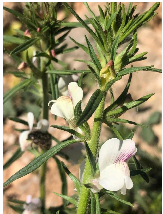
Figure 2. Field photo of Misopates calycinum from Mallorca. Figura 2. Foto de campo de Misopates calycinum de Mallorca.

Mallorca: Between Santa María and Bunyola, 31SDD7690, 120 m, waysides, 11 March 2016, J. Rita & L.A. Domínguez (UIB 16819) (Figure 2).