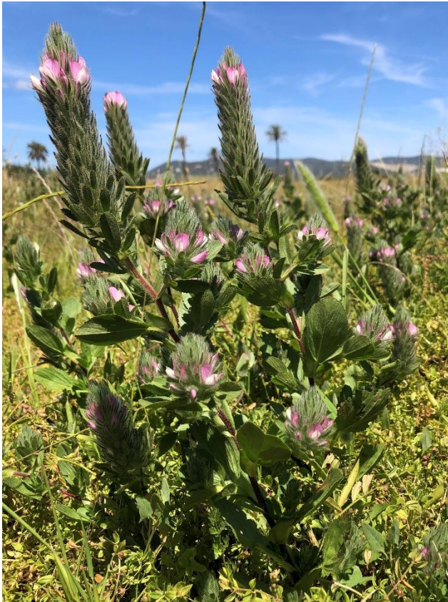
Figure 4. Field photo of Ononis alopecuroides from Eivissa, Sant Francesc.

It is interesting to notice that the fruit of Opopanax chironium drawn in Flora iberica (Villar, 2003, lam. 111) was based on the sheet MA 421597, which corresponds to Ferula communis .