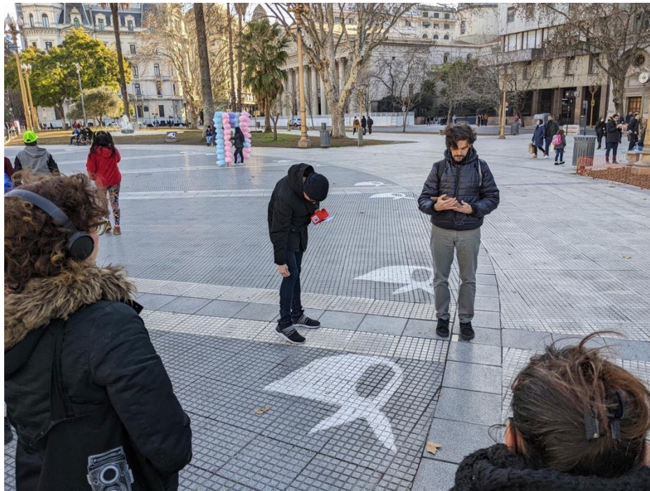
Figure 2. Participants of Última(s) catástrofe(s) walk around the Pirámide de Mayo, following the stenciled outlines of the white pañuelos , symbols of Madres de Plaza de Mayo and their silent path of protest.

memorate (Figure 2). As the performance progresses, the audience's circular path progressively tightens around the monument's base. In this manner, participants circle the pyramid two times, listening to "Agua en mis zapatos," "Ruge mi viento," and "Estado Memoria," a trio of songs that take on the point of view of Madres protesting in literal and figurative storms.