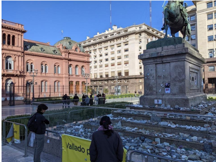
Figure 5. The performance pauses to reflect on the memorial for those who died during the Covid-19 pandemic, which emerged around the base of the General Manuel Belgrano statue in front of the Casa Rosada.