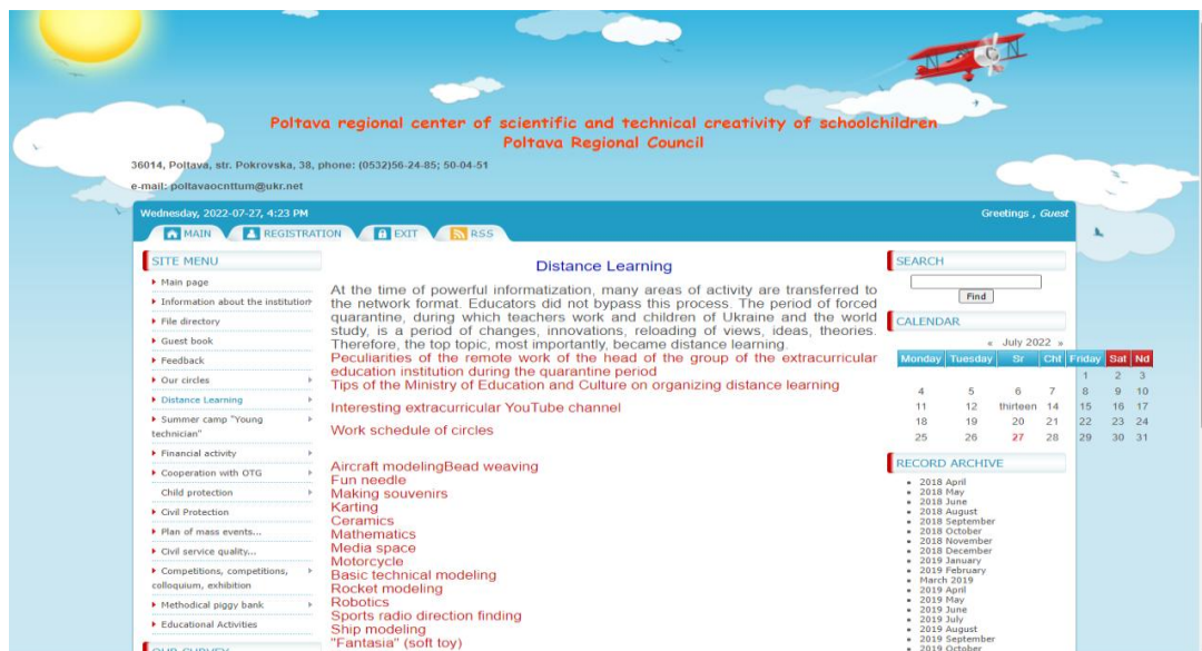
Fig. 2. «Distance learning» page of the website of the Poltava Regional Center of Scientific and Technical Creativity of Pupil Youth of the Poltava Regional Council

The organization of distance learning is highlighted on the website pages (Fig. 2).