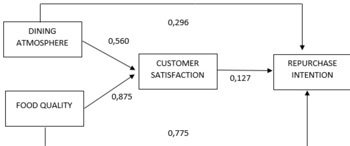
Figure 2. Research result