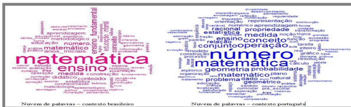
Figure 1. Word cloud of the corpora of the Mathematics subjects' menus of the undergraduate courses of Brazil (Licn1) and Portugal (Licn2).