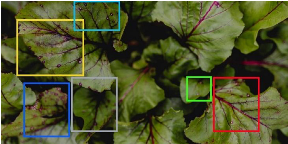
Figure 3.

In conclusion, the future of plant disease classification using AI and ML holds great promise, with the potential to revolutionize the way that plant diseases are diagnosed and controlled. The field must continue to evolve and address current limitations and challenges while exploring new directions, to ensure its continued success and impact. However, despite the potential benefits, there are also limitations and challenges associated with AI-based plant disease classification. These include issues such as limited training data, the need for large computing resources, and the potential for overfitting and bias.