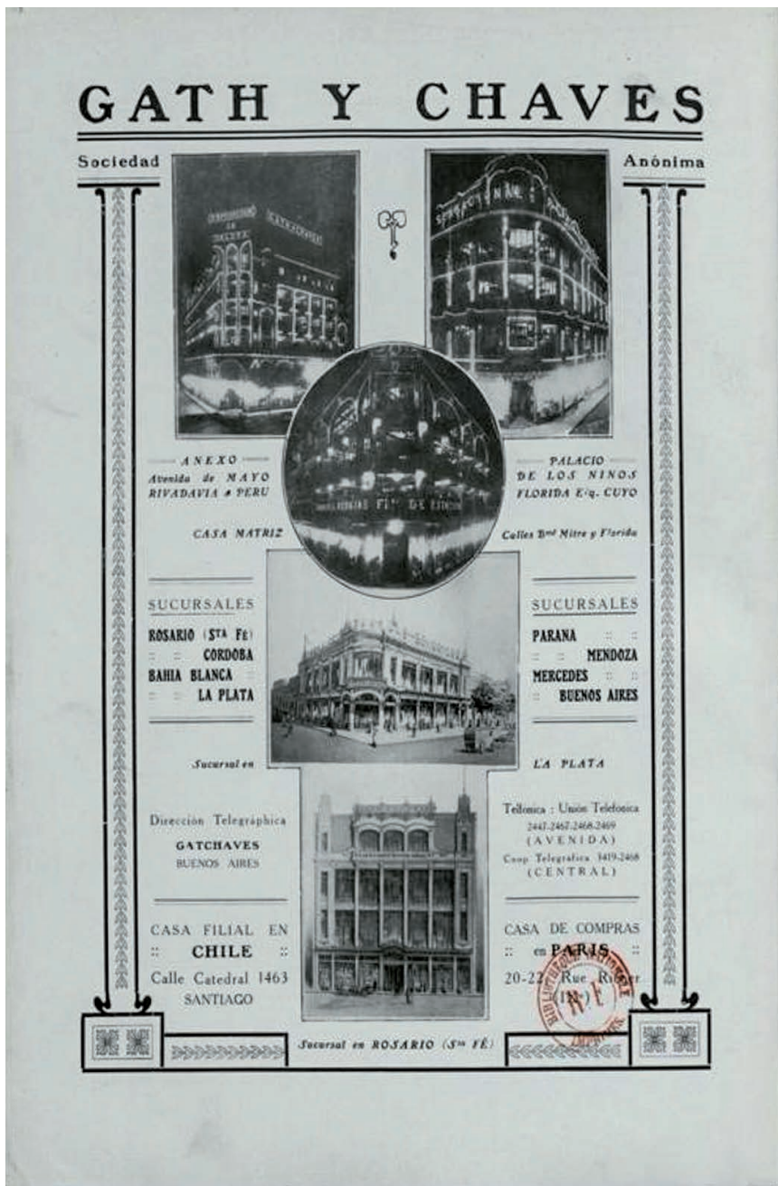
Figure 2. Gustos y Gestos, Nº 3, 1.09.1910, p. NP.