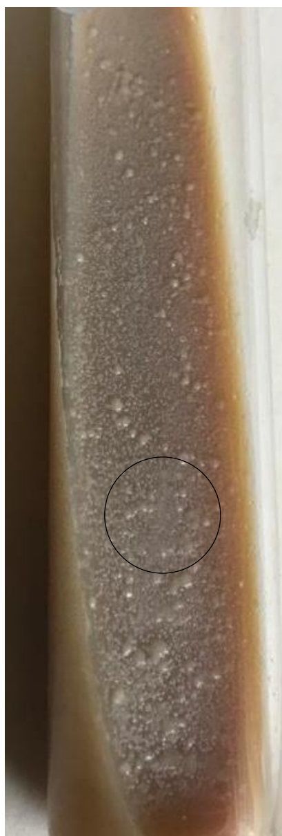
Figure S1. Bacteriological isolation showing colonies compatible with Mycobacterium avium subsp. paratuberculosis (MAP, circle) at 28 weeks post infection in HEYMP medium from the vermiform appendix rabbit ID3 (14 weeks of incubation).