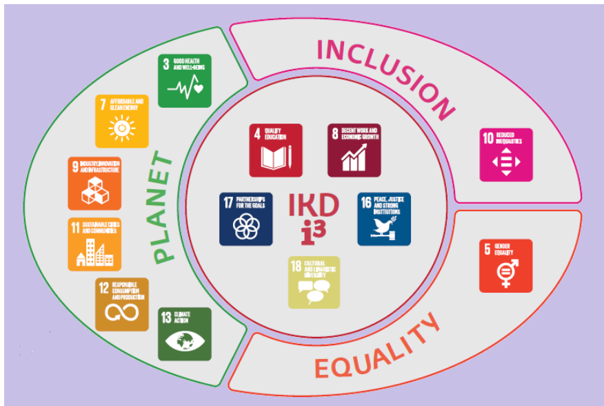
Figure 1. Diagram of concentric circles: integration, transversality, and precision in the EHUagenda 2030 for Sustainable Development

In addition to redefining its educational model, the UPV/EHU drafted its own 2030 Agenda for Sustainable Development, focusing on a rationale for creating interconnections between existing priorities and practices (Figure 1).