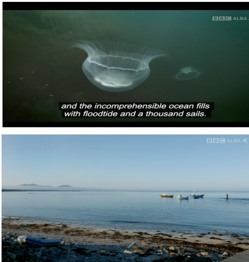
Figure. 3 Iorram (Boat Song) (Cole, 2021)