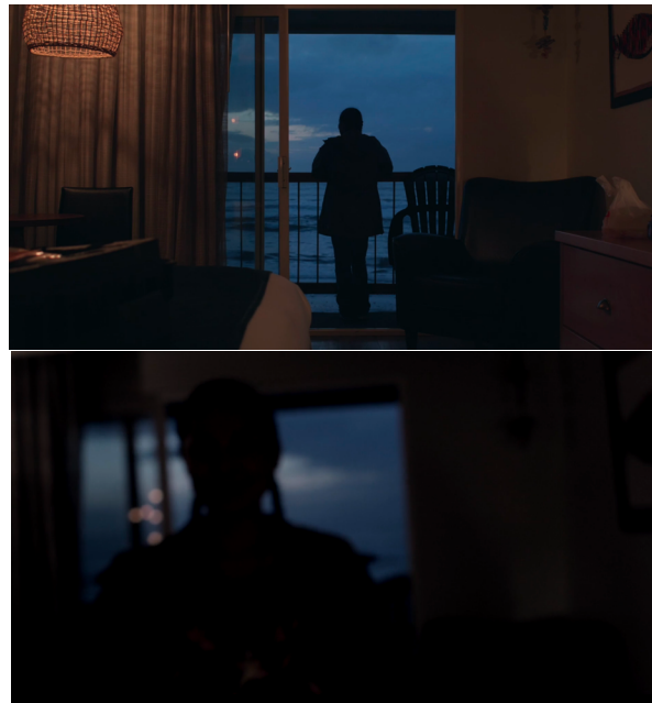
Figure. 1 Małni – Towards the Ocean, Towards the Shore (Hopinka, 2020)