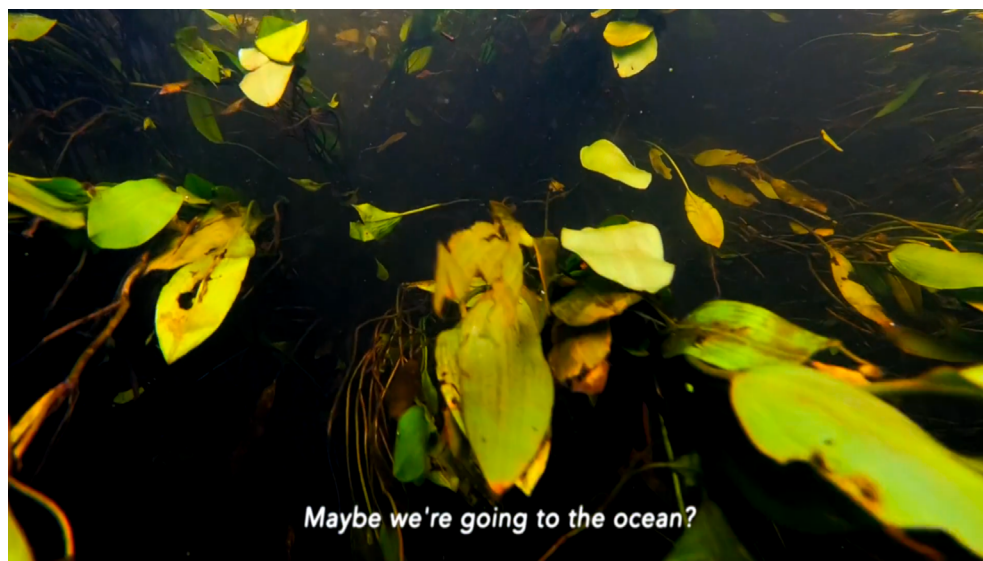
Figure. 2 Małni – Towards the Ocean, Towards the Shore (Hopinka, 2020)

“Where are we going now? Maybe we’re going to the ocean? Maybe we’re going upriver? Maybe we’re going downriver? Maybe we’re going towards the ocean?”