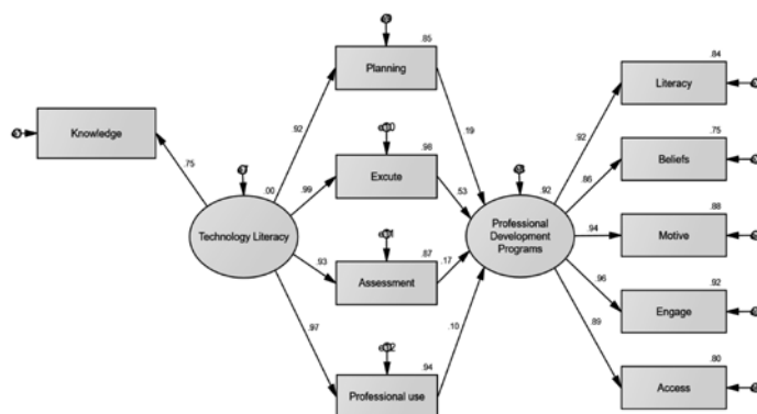
Figure 2. The Research Models in the Standardized Estimation Mode for the Second Research Question

The following tables show the results of SEM analyses for the second research question.