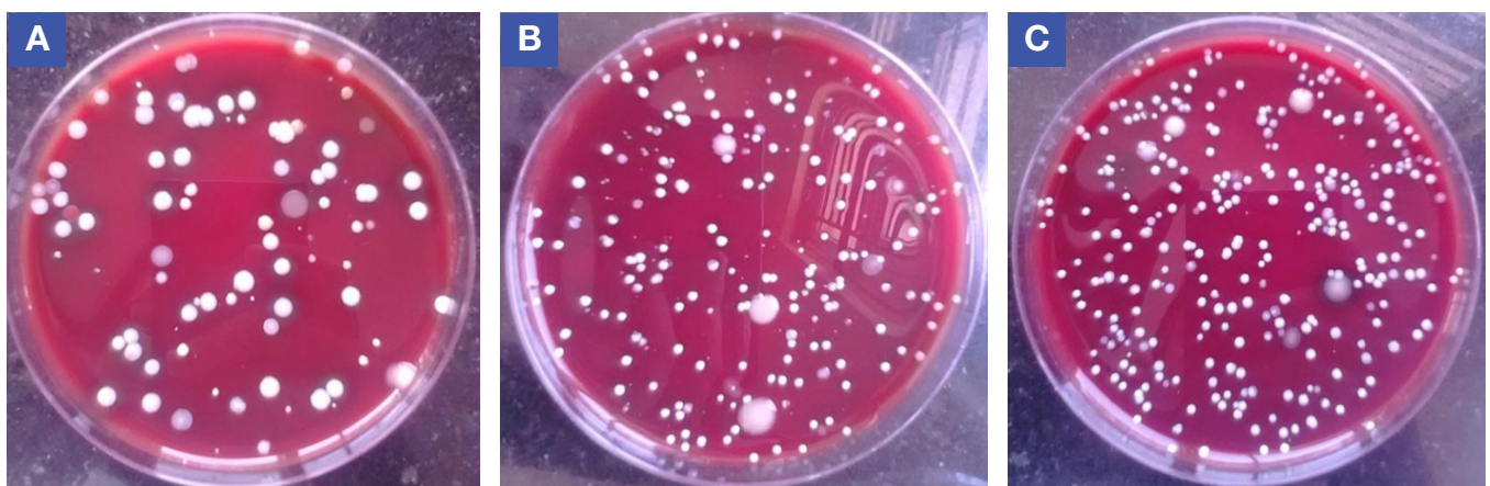
A. Chlorhexidine mouthrinse. B. Morinda citrifolia mouthrinse. C. Distilled water.