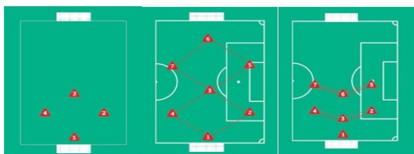
Figure 1. 4v4 formation, 7v7 attacking formation and 7v7 defending formation (PSSI, 2017)