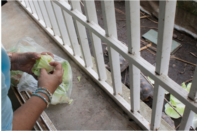
Figure 3. Aida feeds left-behind tortoises as part of her routine.

Caucagüita, at the eastern edge of Caracas, was built in the 1970s and 80s as a state-sponsored urbanización for low and middle-income families. As in similar developments, residential blocks were soon surrounded by self-built settlements. The area known as Sector la A has 440 units distributed in 22 buildings. There, the coordinated action of neighbors looks after left-behind apartments and those living in them. There is no official emigration census, but Ana, a local community leader, recalls vacant units in every building. Her account of collective organization reveals dynamics more in common with those of distant middle-class neighborhoods than with nearby barrios. Residents have lived here for many decades, “everyone knows each other, and there is a sense of belonging, so people protect their spaces,” she explains. In contrast, “in ranchos where there is more mobility, the problems are different.” Ana describes an occasion when she noticed a leak on a ceiling and immediately notified the owner abroad and a time when neighbors collectively averted an invasion attempt on a vacant unit.