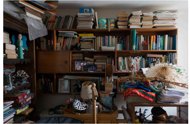
Figure 2. Second bedrooms often become storage for owners' belongings.