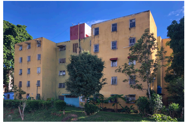
Figure 4. View of residential buildings in Sector la A, Caucagüita

In light of the above, considering Caracas as a departure city can expand the disciplinary discussion around this concept by pointing to the socio-economic and urban regenerative potential of vacancy through the coordinated agency of migrants and non-migrants. This coordination shows a distinct mode of migrant participation and cross-border cooperation that differs from documented instances of diaspora involvement through remittances and real estate development. This process also repositions of local