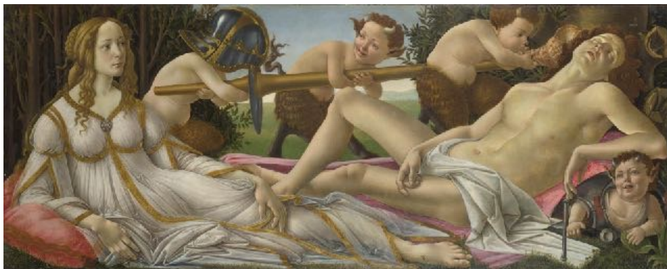
Fig. 10 Sandro Botticelli, Venus and Mars , c 1485, National Gallery, London

But does it make sense to make a memento mori or to represent the Fates, so closely linked to death, in an epithalamic painting? Yes, because these three characters not only deal with the end of life, but with its entire development, and they are in charge of establishing its fundamental moments, Clotho that of birth, Lachesis that of marriage and Atropos that of death 33 .