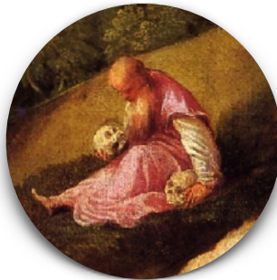
Fig. 16b Titian, The Three Ages of Man , detail