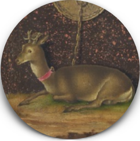
Fig. 14a Jacometto, Portrait of Alvise Contarini , detail, ca. 1485–95, MET, New York, detail. OA