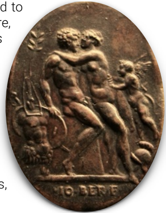
Fig. 12. Giovanni Bernardi, Mars, Venus and Amor , 1510-1520, Bayerisches Nationalmuseum (Saal 23)

The same is true of another work by Bernardi from the same period, Pan and Siringa [Fig. 13], in which the positioning of the protagonists around a flute, who appear to be playing together, is very similar to that of the couple in Titian's painting. This could be a further allusion to the painting by the author of the medal, or another red herring by the designers of the painting, who link it to this sad story by using an iconography undoubtedly familiar to the addressee.