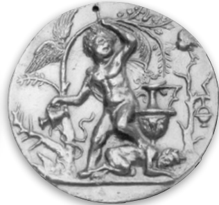
Fig. 15c Andrea Briosco, Allegory of Virtue , c.1515, MET, New York, OA