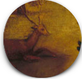
Fig. 14c Paris Bordone, Mars, Venus with Cupid , detail, 1559-60, Galleria Doria Pamphili, Rome.

It would also favour an epithalamic interpretation if the animal in the background [Fig. 14b] were a roebuck, a symbol of marital fidelity in nearby works such as the one on the reverse of the male portrait –paired with a female one– by Jacometto (c. 1485-1495) 44 , which [Fig. 14a] shows an image of a roe deer in chains with the Greek word ΑΙΕΙΕΙ, 'forever' 45 . However, it could also be a stag, sometimes a symbol of ardent sexual appetite, and often depicted with Mars, Venus and Cupid, as can be seen in the detail [Fig. 14c] of a painting of this subject by Paris Bordone, a pupil of Titian. The difficulty in appreciating the distinctive horns in the painting – they are intermingled with the grove of trees behind them– and in interpreting which animal and symbol they are, suggests a game of ambivalence 46 .