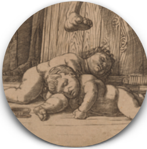
Fig. 21a Mantegna, Bacchanal with a Wine Vat , c. 1470, detail