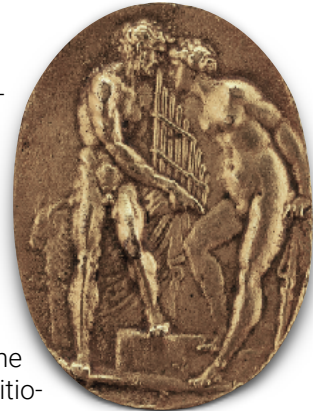
Fig. 13. Giovanni Bernardi, Pan and Syrinx , 1510-1520 National Gallery of Art, 1996.82.5. (CC0)