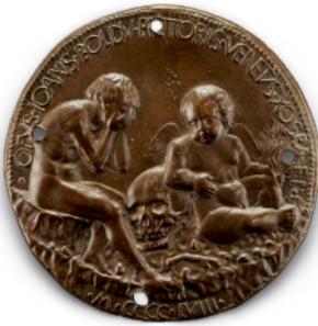
Fig. 18a Boldù, as in fig. 4, reverse