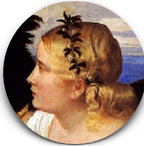
Fig. 19b Titian, The Three Ages of Man , detail