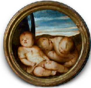
Fig. 21c Romanino, Pala de St. Giustina , 1513, Museo Civico Padua, detail, CC

establishes the beginning of man's life. Although the flame that accompanies this character on the medal does not appear in the painting, its effects on a tree that seems burnt rather than dry do seem to be present.