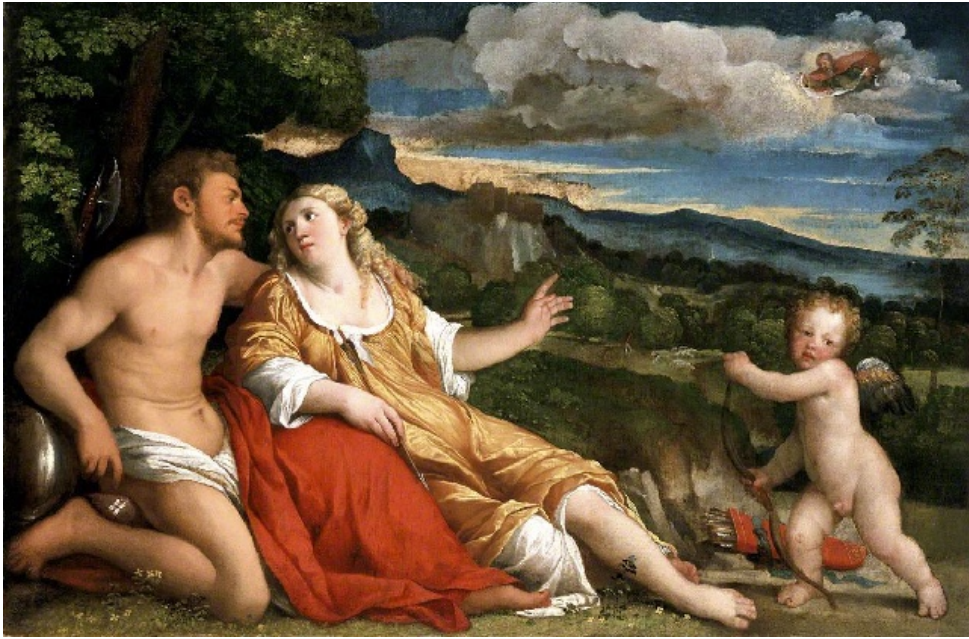
Fig. 11 Palma il Vecchio, Mars, Venus and Cupid, c.1520