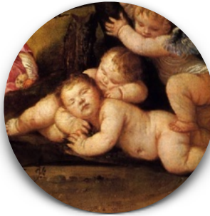
Fig. 21b Titian, The Three Ages of Man , detail