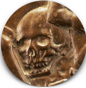
Fig. 22a Boldù, as in fig. 4, reverse, detail