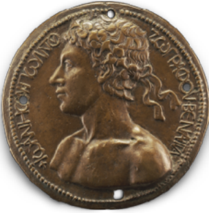
Fig. 19a Boldù, as in fig. 4, obverse