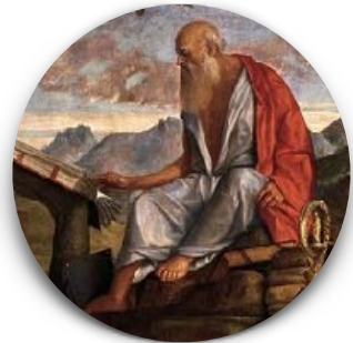
Fig. 16c Bellini, San Girolamo , 1513, San Giovanni Crisostomo, Venice, detail