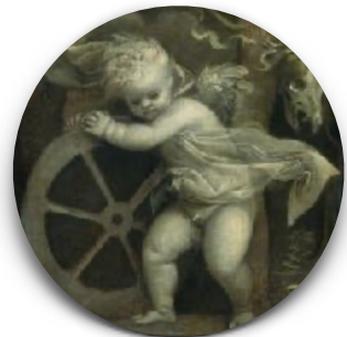
Fig. 20c Titian, Cupid with the Wheel of Time , c. 1515, detail, National Gallery of Art, Washington, DC. (CCO)