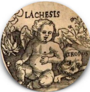
Fig. 20a Apianus, as in fig. 3, detail

As I have already pointed out, the similarity of the composition to the iconography of Mars, Venus and Cupid has led us to see the god of love in the winged child holding the tree or leaning on it while watching over the dreams of the other two [Fig. 20b]. 63 However, in the light of Boldù's medal, we can see in him the genie of death or, if we follow Celtes' interpretation [Fig. 20a], Lachesis, the reaper who