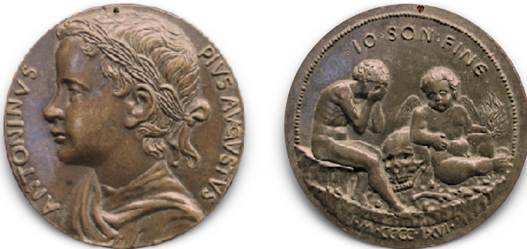
Fig. 6 Giovanni Boldù, Caracalla, imperatore romano (recto); Un personaggio seduto, Museo del Bargello, Firenze, 1466, N. Inv. 5932