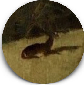
Fig. 14b Titian, The Three Ages of Man , detail