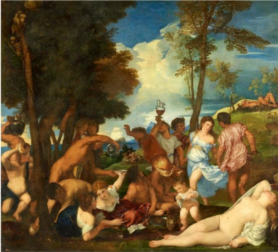
Fig. 4. Titian, Bacchanal of the Andrians , 1524, Madrid, Museo del Prado

ra until 1516 15 , this is the earliest date compatible with Vasari's narrative. Notice that it agrees with Erwin Panofsky's idea of an «immediate» relationship between this painting and The Bacchanal of the Andrians [Fig. 4] 16 .