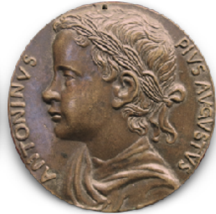
Fig. 19c Boldù, as in fig. 5, obverse

On the night of their wedding, Tobiah said to Sarah, «We are descended from a people of saints, and we cannot join together like the heathen, who do not know God». The two of them got up and together they prayed fervently. They asked God for his protection.