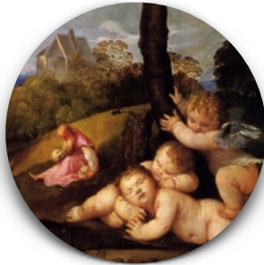
Fig. 15b Titian, The Three Ages of Man , detail