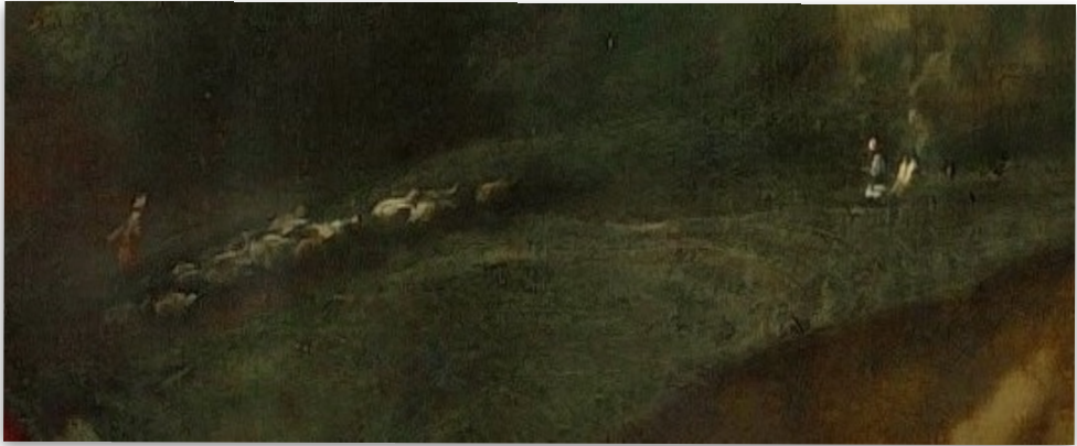
Fig. 23 Titian, The Three Ages of Man , detail

tree, on an unhappy love. We are in that idyllic place where beauty and happiness are accompanied by unhappy love and even death —like those of Androgeo, Filis or Massilia— which gave the title — Et in Arcadia Ego — to the brilliant paintings of Paussin and Guercino, and which has also been proposed for this canvas by Titian 67 .