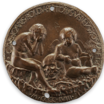
Fig. 2. Giovanni Boldù, Boldù with the Genius of Death

The painting –which we can now call L'amor e la morte ( Love and Death )– is an advice to the newlyweds that, before consummating their union –a moment of thoughtless happiness –they should restrain their desire for a moment and remember that, although they feel they are already united forever, the thread of their lives and those of their loved ones can suddenly break, and that only by maintaining the bond that now unites them until then will they achieve a love that lasts beyond death .