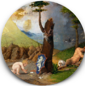
Fig. 15a Lorenzo Lotto, Allegory of Virtue and Vice , detail, 1505, National Gallery of Art, Washington, DC. (CC0)

This ambivalence can also be seen in the split tree that seems to support the winged putto , perhaps to prevent it from falling on the sleeping children, which resembles the greened trunk in Lorenzo Lotto's Allegory of Virtue and Vice (1505) [Fig. 15a], or An-