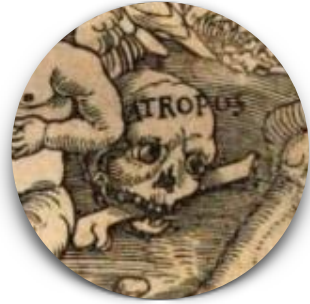
Fig. 22c Apianus, as in fig. 3, detail

the precise form of Atropos [Fig. 22c], the Fate who determines the end of life. Consequently, it suggests a reflection about the remaining years, that is, a less blunt, more palatable memento mori in the moment of greatest happiness.