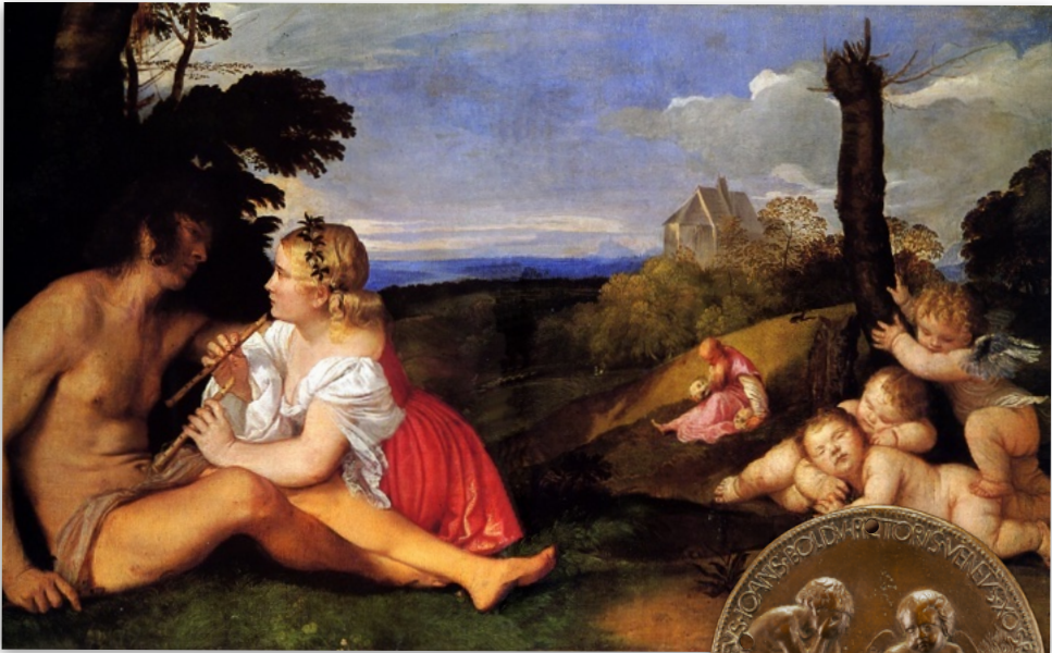
Fig. 1. Titian, The Three Ages of Man , 1516-1524, Edinburgh, Scottish National Gallery