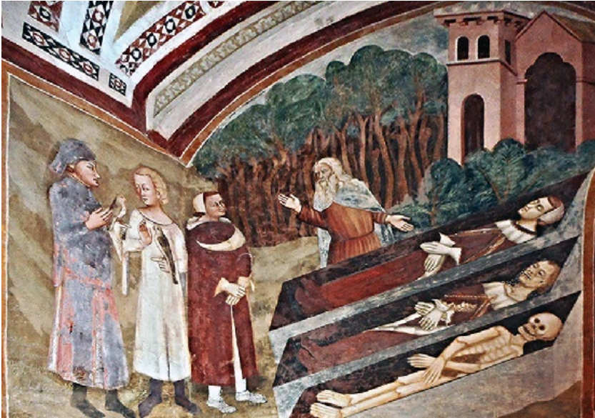
Fig. 17 Guido da Siena (?), The Three Living and the Three Dead , 14th c., Sacro Speco, Subiaco. Author's image retouched to correct bias

three couples consisting of a living person —of different ages or classes— and a deceased person —also of different ages or stages of decomposition [fig. 17] 50 .