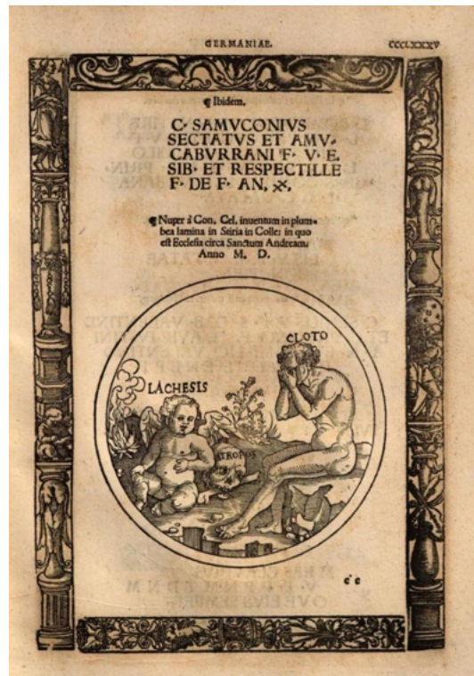
Fig. 3 Apianus and Amantius, Inscriptiones sacrosanctae vetustatis... , Venice, 1534, p. cccLxxxv

it was impossible for Northern artists, when this source reappeared in the Apianus woodcut, to give it their customary interpretation. A new meaning had to be found, on the basis of two clues: the presence of a skull implied an allegory of death; this, however, had to be taken from antiquity, since the design itself was regarded as