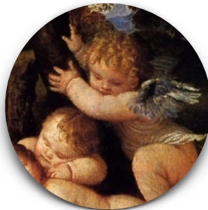
Fig. 20b Titian, The Three Ages of Man , detail