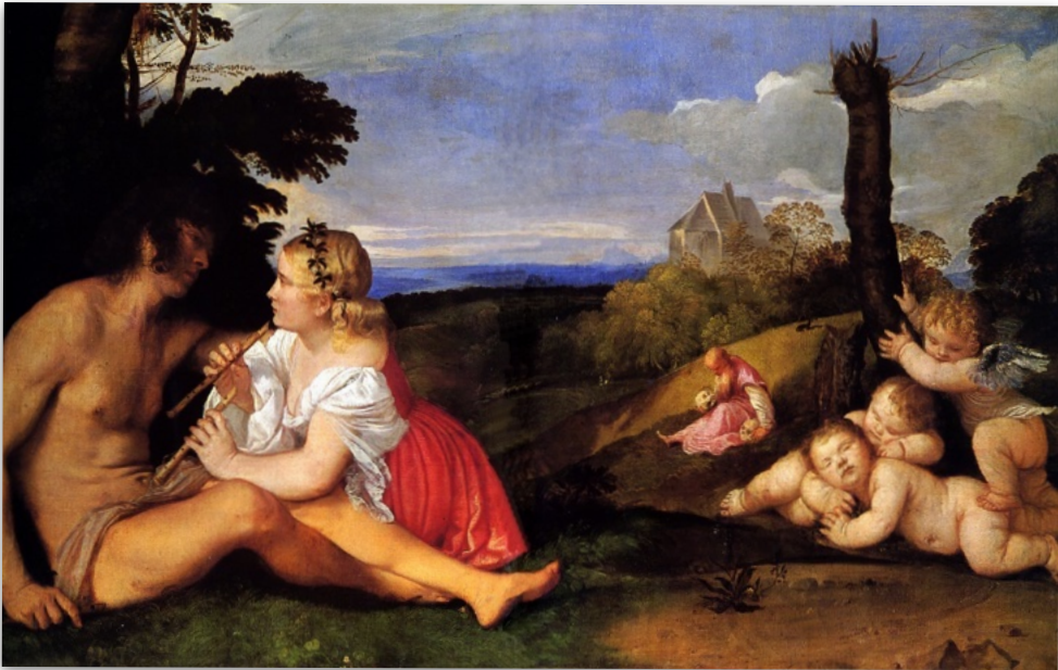
Fig. 1. Titian, Love and death , c. 1516-1524, Edinburg, Scottish National Gallery