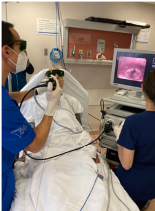
Figure 5. TruBlue photoangiolytic laser through flexible distal chip endoscope (endoscopy suite).