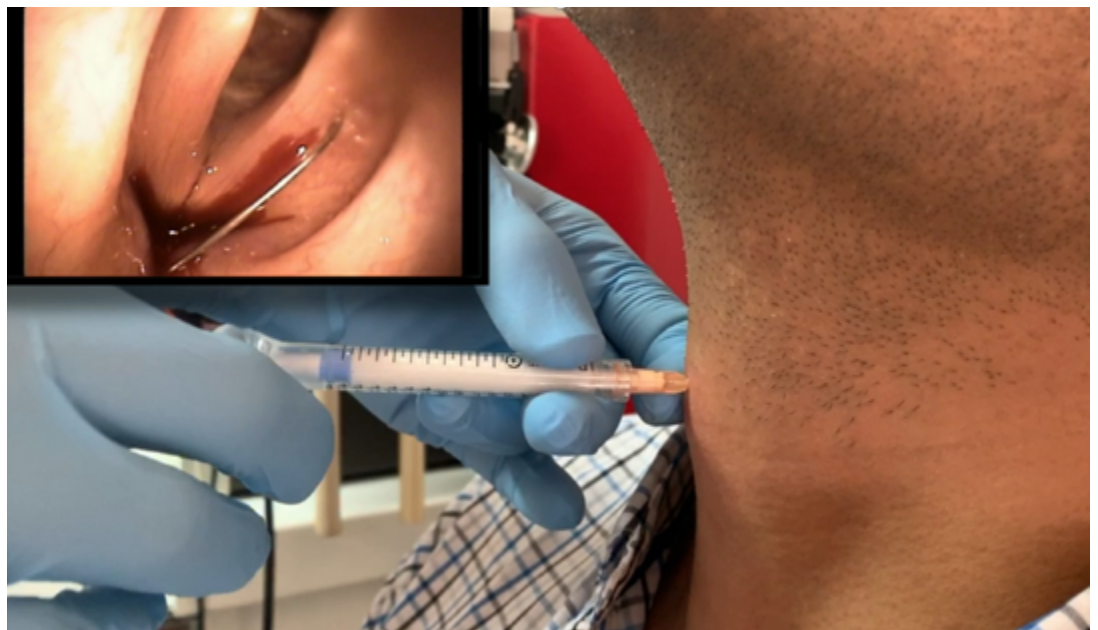
Figure 2. Injection laryngoplasty / vocal fold augmentation. Thyrohyoid membrane (Calcium Hydroxyapatite-CAHA).