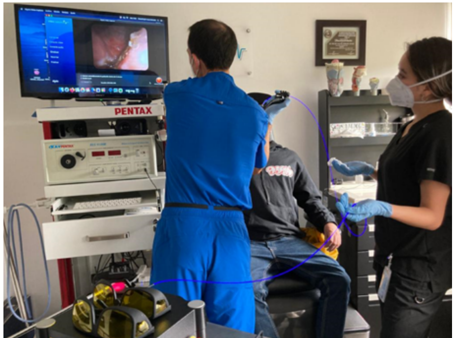
Figure 6. TruBlue photoangiolytic laser through flexible distal chip endoscope (office setting).