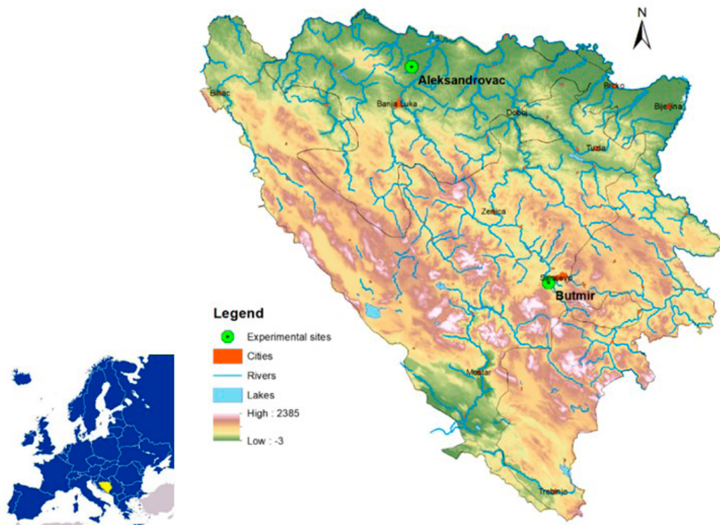
Figure 1. Position of Bosnia and Herzegovina in Europe ( http://www.bosnaonline.org/opce-karte-bosne-i-hercegovine ) and location of experimental sites.

The area of Butmir is characterized by Fluvial soil type (Resulović et al., 2008), with a heavier textural