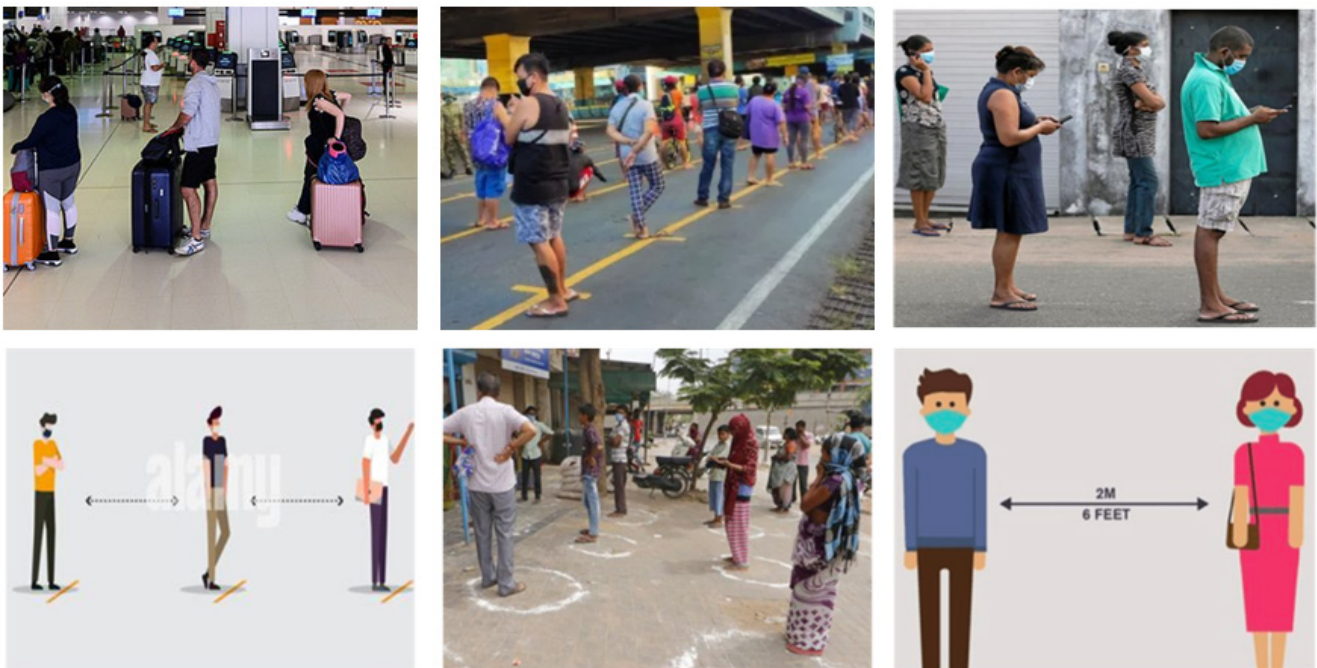
Figure 1. Sample images of social distance monitoring position

Around 8 million individuals all around the world have been infected with this potentially fatal virus as of right now. Medical experts, scientists, and researchers have been putting in countless hours to create a vaccine and therapy for this potentially fatal condition. The global community is doing research into alternative approaches and processes in the hope of controlling the virus's spread. (1,2) In light of the current circumstances, maintaining a social distance has been considered as one of the most effective techniques for reducing the global transmission of this illness. It has to do with increasing the amount of distance between individuals in crowded areas while simultaneously decreasing the amount of direct physical touch that occurs between them. By limiting the amount of close physical contact that individuals have with one another, we may bring the curve depicting reported cases down and reduce the likelihood of viral transmission. Maintaining a healthy social distance is essential for those who have a greater likelihood of developing a serious disease as a result of COVID-19. (3)