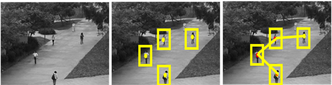
Figure 4. Distance measurement example

The estimated distance values are used to determine a T threshold value. This value is used to determine if any two or more people are separated by less than the T pixel threshold. The following equation is used to calculate the threshold T: