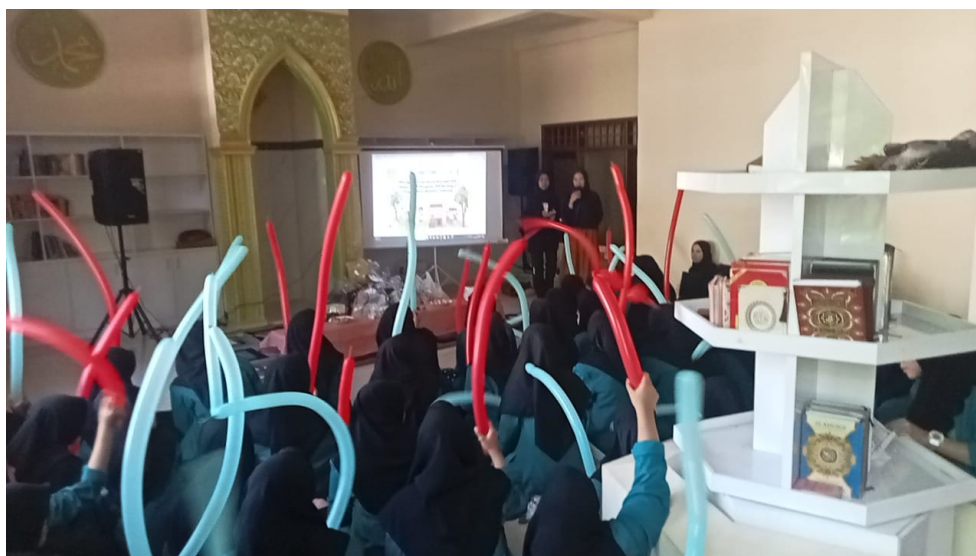
Figure 1. The students rise the balloons up for answering the pre and post test