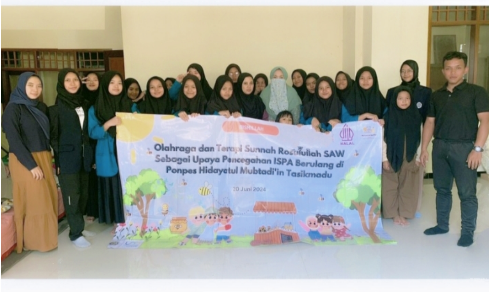
Figure 4. The documentation after the event has done

This community service project implemented a combined intervention program using physical activity and Sunnah-based therapy to reduce the frequency of RTIs among students at an Islamic boarding school. The findings suggest a potential benefit of this approach, although further research with a more robust design is necessary. The project highlights the importance of culturally sensitive preventive measures that integrate Islamic practices with physical activity to promote the health and well-being of students in boarding schools.