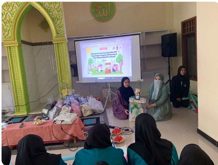
Figure 3. Giving gifts of honey and medical equipment