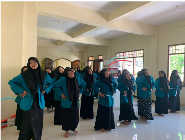
Figure 2. Physical activity by participants