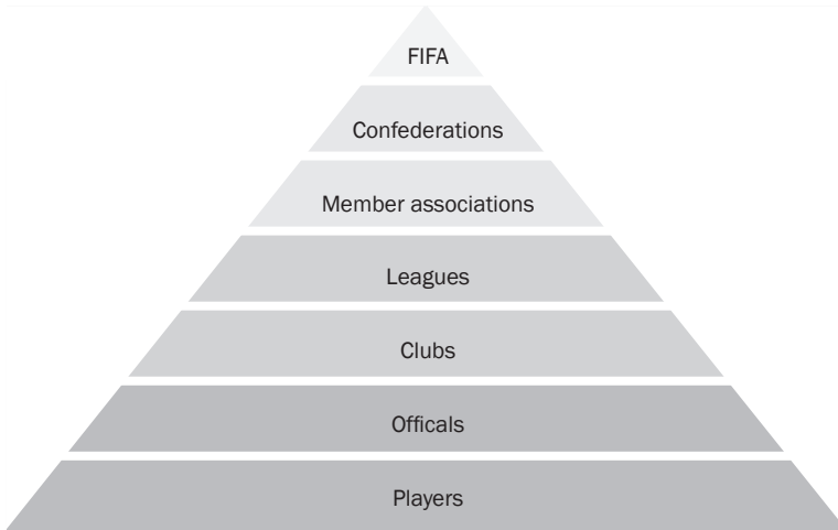
FIGURE 1 Hierarchy of FIFA's governing bodies

At the top of the FIFA pyramid of control lie its Congress, 124 Council, 125 General Secretariat, 126 and various standing and ad hoc committees. 127 Next, there are the six FIFA confederations, which consist of regional groupings of the 211 FIFA-recognized national membership associations. 128 In exchange for financial and logistical support from FIFA, these associations are required to abide by the FIFA Statutes and relevant rulings of the Court of Arbitration for Sport (CAS). 129 Within